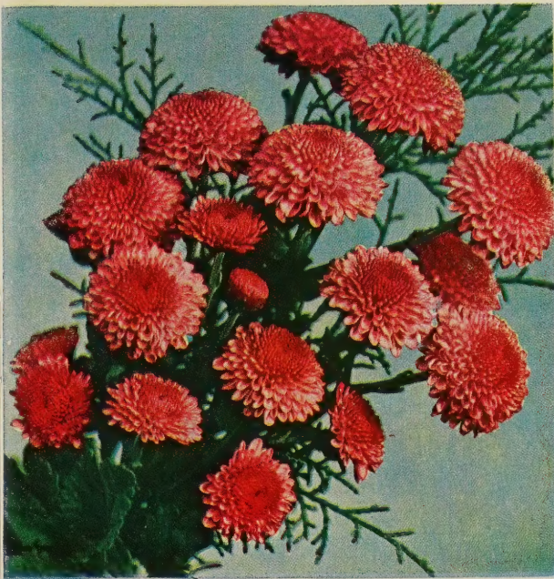
MASQUERADE. $1.00 each; 3 for $2.50